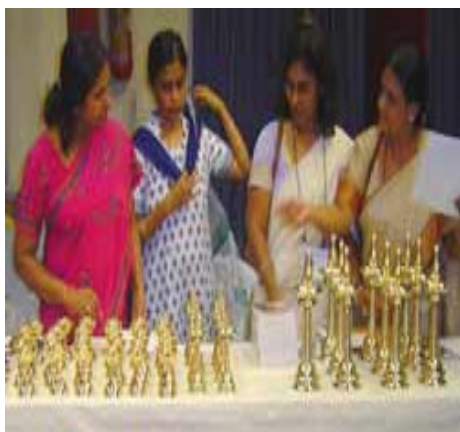
The all women Sanvitti Core Team

The principals and teachers expressed that it was one of the best organized events for students and a very unique one too. The students conveyed that they gained a lot from the extensive knowledge and expertise of the speakers. They were also benefited from the innovative competitions, which provoked their thought process