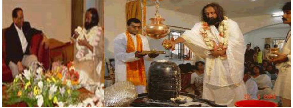
GURUDEV IN MAURITIUS

“Lighthouse” welcomes articles, photos, experience-sharing etc., from our Art of Living family.